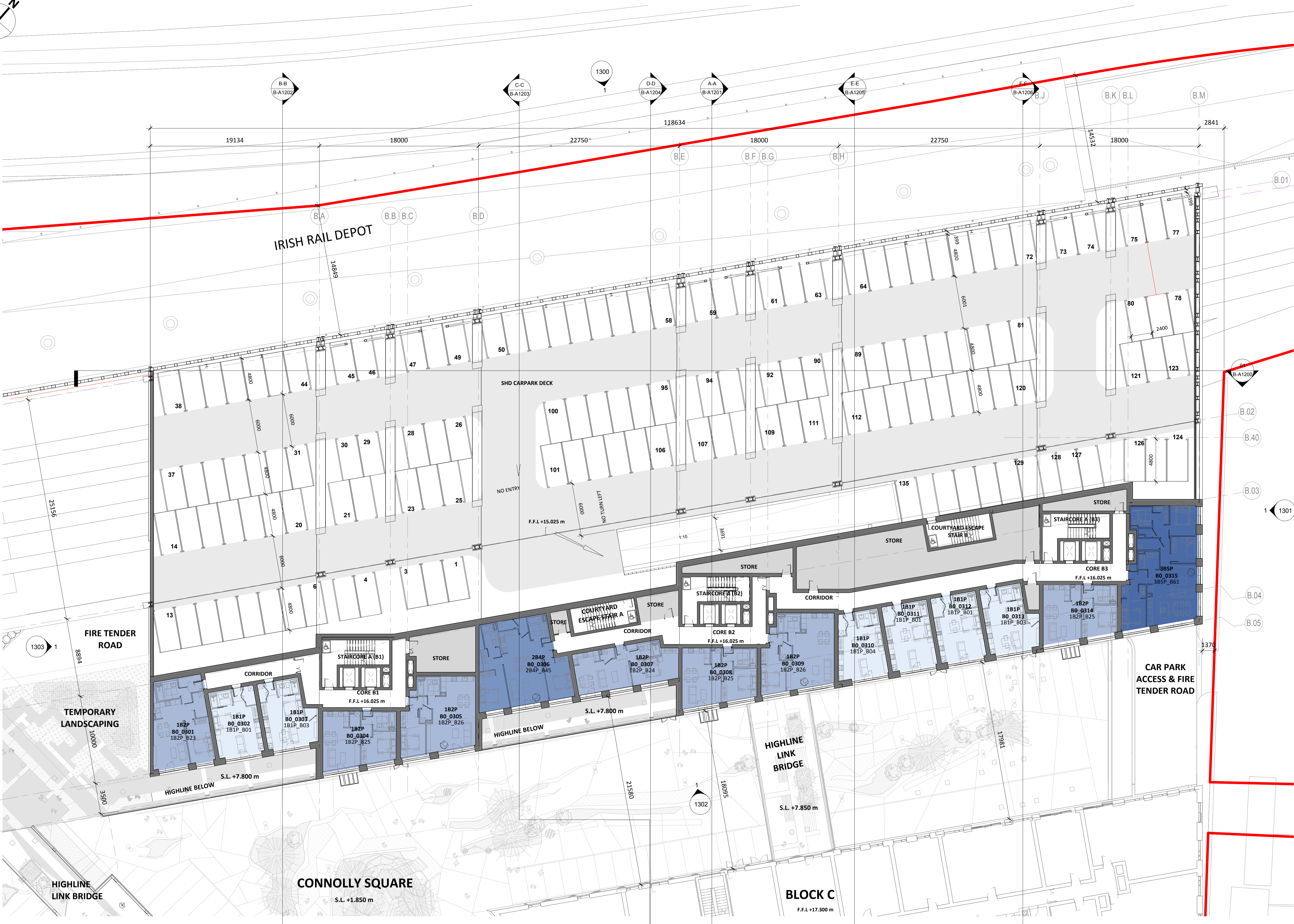
1 BLOCK B PLAN_LEVEL 03 1 : 200